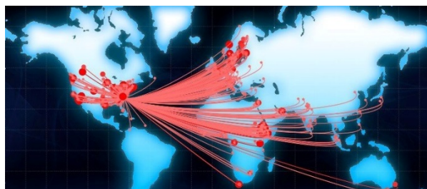
Figure 1 Sample Locations of ESAN Members

Ethiopia has several higher education institutions with a variety of experiences and priorities. The primary objectives of these institutions are to produce white-collar workers, teachers, and the work force for mining, textiles, construction, agricultural industries. Higher education and scientific research are young enterprises. Following the deliberations of higher education meetings and the literature on African higher education there is a growing advocacy on structural changes in higher education, North-South institutional linkages, mobilization of the African/Ethiopian Diaspora and funding. The growing internet use and the quality of